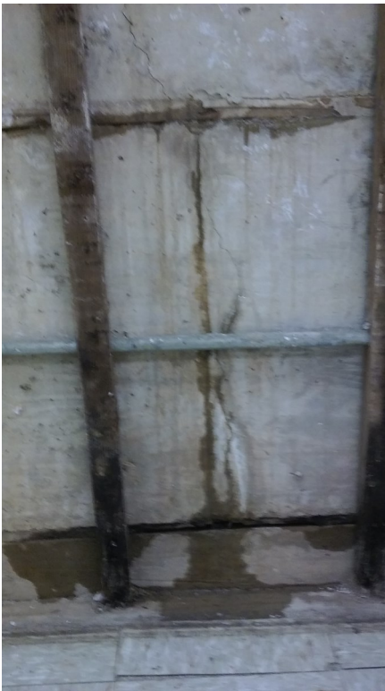
Flooding at Yorkshire September 1, 2021